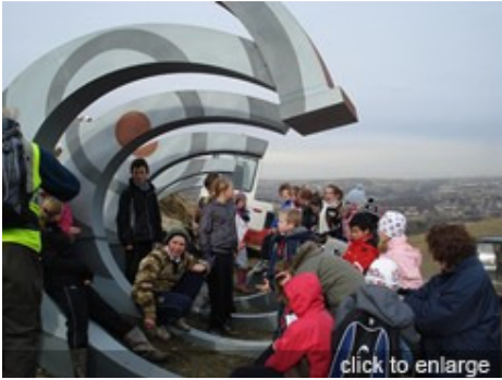
Children from Britannia Primary School enjoying Ferroterrasaurus

The sculpture focuses on the area's heritage and highlights the stunning views around Lee Quarry. Mid Pennine Arts worked with schoolchildren from Holy Trinity Primary School who helped to design The Frond and helped with the mosaic panelling.